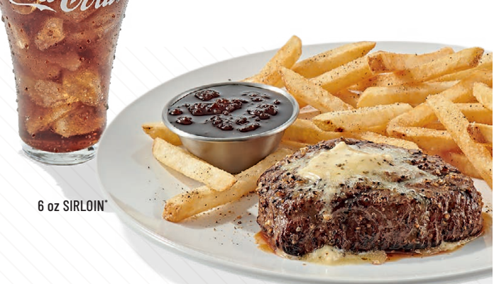
6 oz SIRLOIN*

CRISPY CHICKEN FINGERS cal 810-980 $9.99 Three chicken fingers, seasoned fries, coleslaw, Honey Mustard