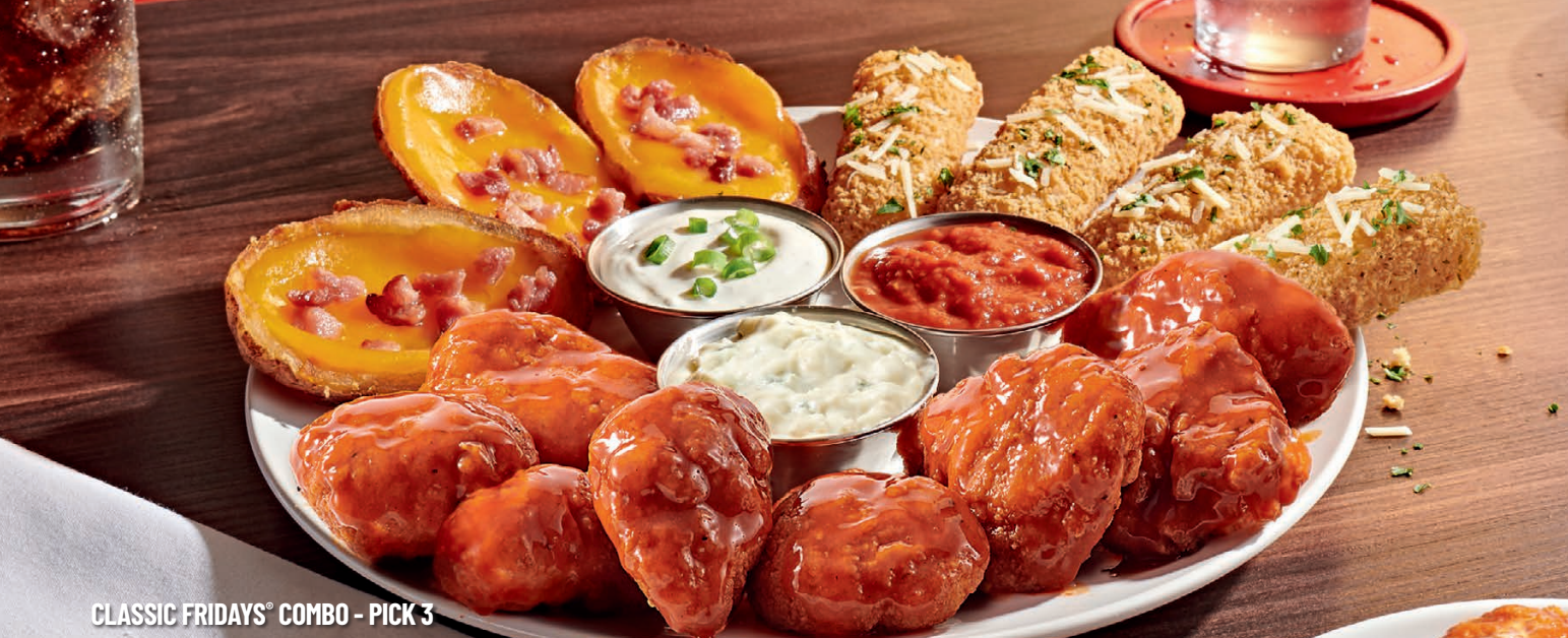
CLASSIC FRIDAYS' COMBO - PICK 3