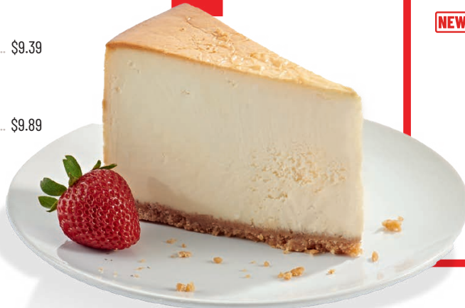
NEW YORK CHEESECAKE