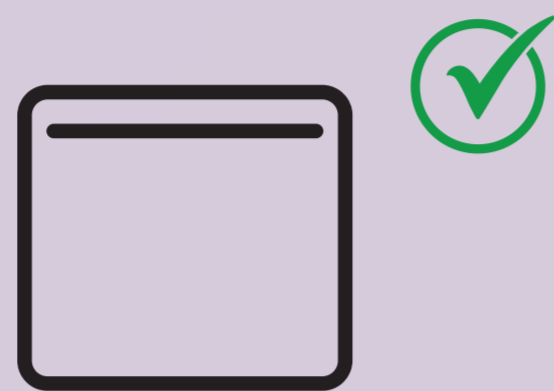
1 Gallon Freezer Bag