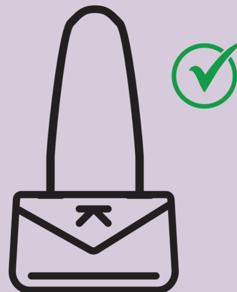
Clutch Bag w/ Shoulder Strap