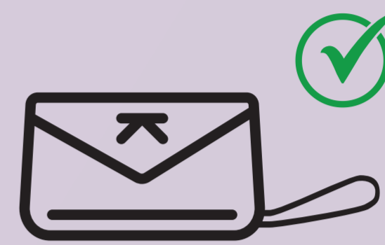
Clutch Bag w/ Wrist Strap

Clutch not to exceed 5" x 9" x 2" in size